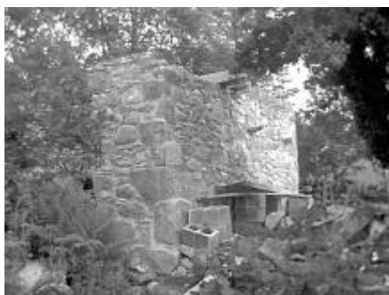
The elevation of the workshop facing the garden The projecting long stones will support the veranda