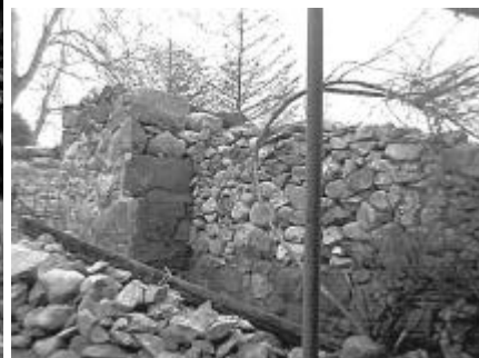
The elevation of the garage facing the yard lane The wall on the right will conceal the service connection to the main house