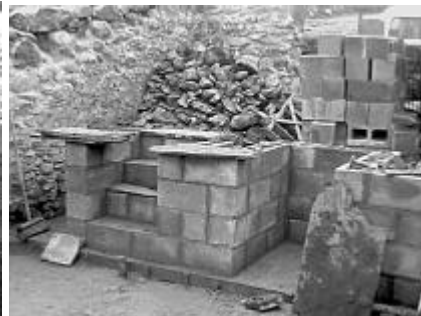
The interior stairs and pit made in blocks. Both ground floors will be insulated and heated The generator will be hidden in the chamber on the left where broom is, under the second flight of stairs

We are designing Bio-power House to be an example of sustainable practice, not just in the use of renewable materials (timber, stone with lime mortar slate and straw bale insulation), but also in the way it will be heated and serviced. The new concrete floors to the workshop and garage are already laid on insulation, and have embedded heating pipes. These will be the radiator to a diesel generator that will provide the hot water, and the electricity for the whole building and also provide electric power to the main house. The generator will run continuously providing both electricity and hot water from waste fat.